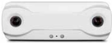
FLIR Brickstream 3D Gen 2 with BLE and WIFI