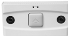
FLIR Brickstream 3D+